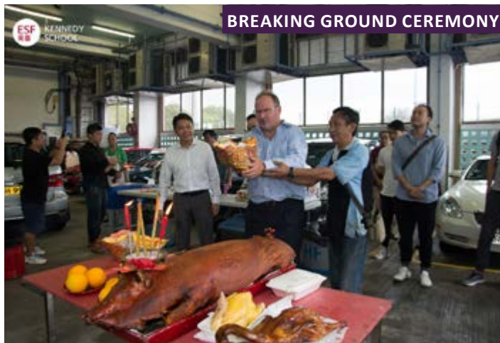
BREAKING GROUND CEREMONY

KENNEDY SCHOOL YEARBOOK 2017 WILL BE ARRIVING AT THE SCHOOL ON THE 26TH JUNE 2017. ALL PRE-ORDERED COPIES WILL BE DISTRIBUTED THE FINAL WEEK OF SCHOOL. HAVE YOU PRE-ORDERED YOUR COPY? ORDERS CAN BE MADE AT RECEPTION.