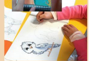
Cartoon & Manga