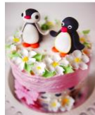
Tailor made cake